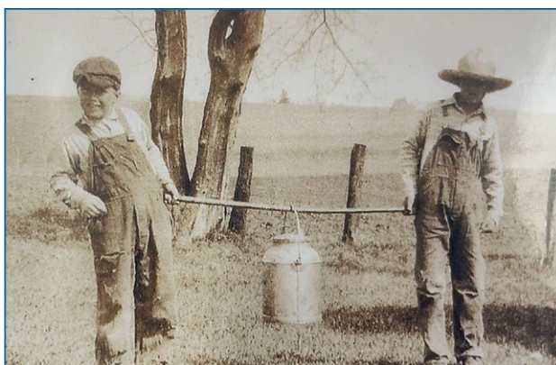
Two schoolchildren carry water to their school in this undated photo from the Allamakee Genealogy Research Center.