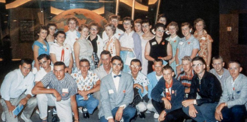
During the first annual Youth Tour, participants visited with local legislators, toured the U.S. Capitol and White House and learned more about the Rural Electrification Administration.