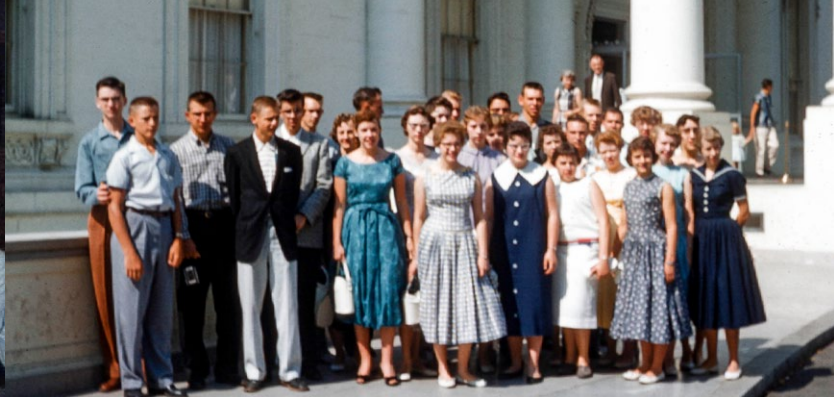
The delegation from Iowa poses in front of the White House.

Washington Cathedral and touring the USDA Research Center in Beltsville, Maryland.